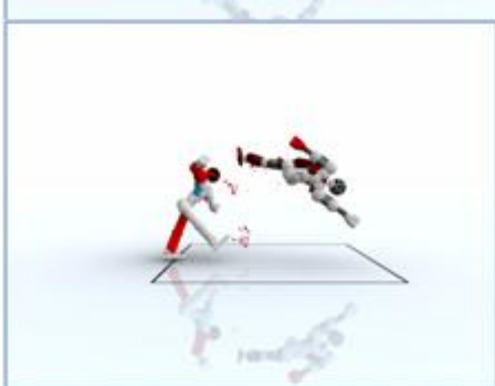
Jepoy's Amazing "55 frames DQ" (Week 5 – ToriSumo)