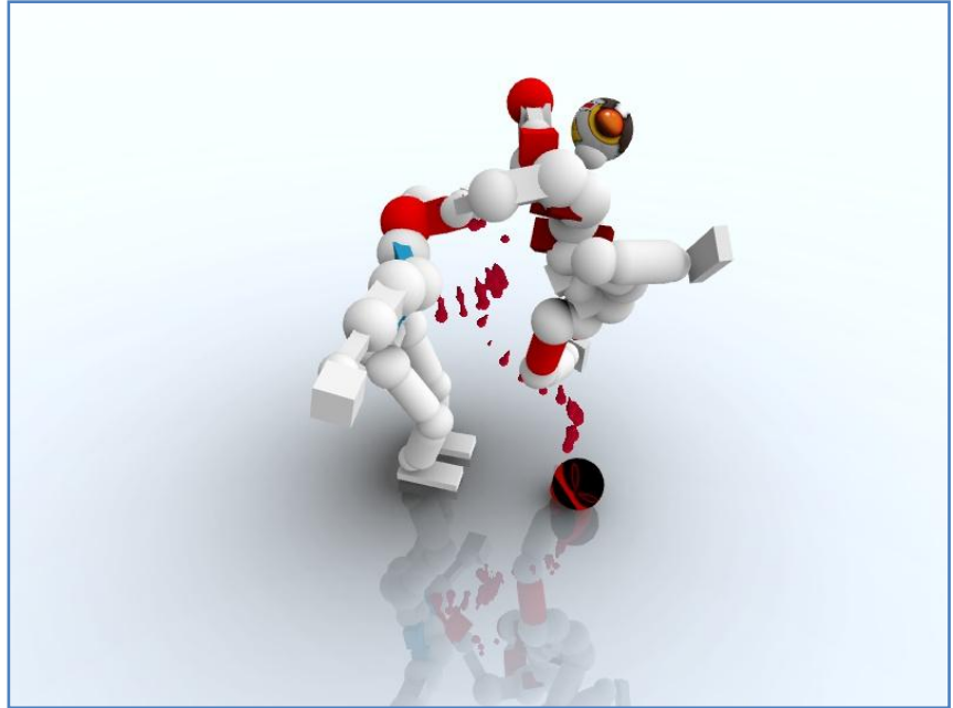
TIMUCHEN : Decap and Head DQ in 37 frames (Week 3 – ToriHeadBall)